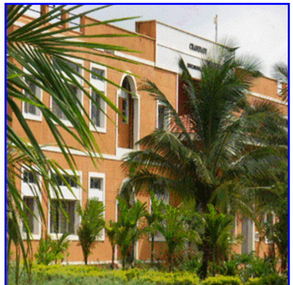
The Chaminade Educational Centre at Deepahalli-Bangalore, home of ACEMS

ACEMS is building up an extensive library of Marianist books, pamphlets and media in Bangalore to support Marianist studies in Asia.