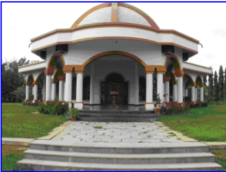
Main chapel at Deepahalli – “Seat of Wisdom”

1. An Asian Seminar on “Marianist Servant Leadership” will be organized by ACEMS from August 7-20, 2011, at Deepahalli-Bangalore. It will be offered to Marianists of all branches of the Family, with the