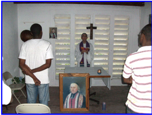
The Haitian Marianist Community was able to celebrate the Feasts of St. Joseph and the Annunciation

Thanks to the kindness of the Benedictines, they are able to use a small structure at the monastery as their community house.