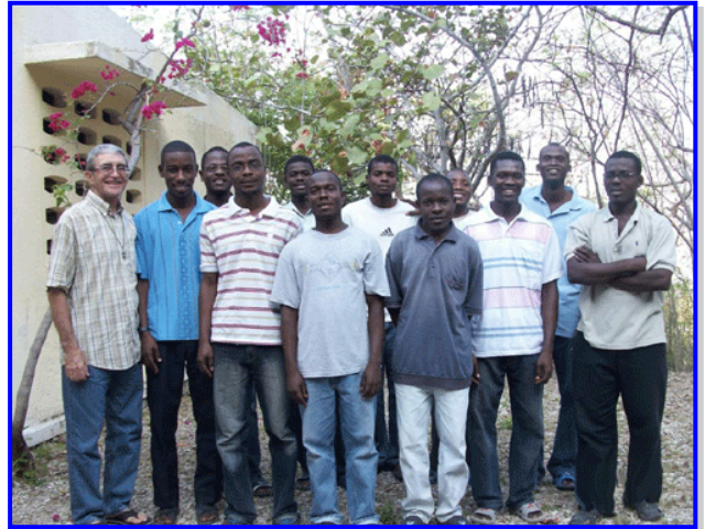
Together Again: Members of the community and those in formation.

Our brothers in Haiti report that they have been welcomed on a temporary basis at the Monastery of St. Benedict, located about 40 miles (65 km) outside of Port-au-Prince. Several members of the two communities have reconvened after they were dispersed following the tragic earthquake. Over the next few months, the rest of the members of the foundation are expected to return.